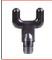
Fork Head suitable for both sides of the spine