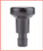
Heating Head can promote blood circulation more effectively