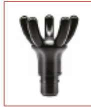
Five-Claw Head for muscles bulging such as calf muscles