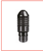
Bullet Head suitable for local pain points and small muscle groups