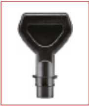
Shovel Head suitable for the spine