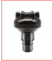
Lotus Head suitable for the soles of your feet