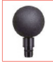
Round Head suitable for the shoulders and neck